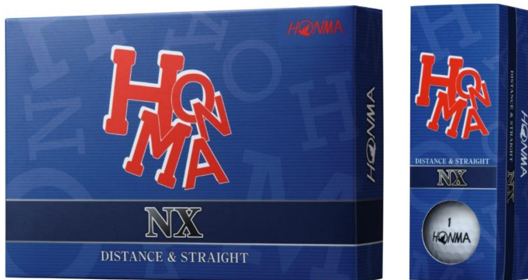
『HONMA NX』 (Color: White)

Please refer to summary details on the next page.