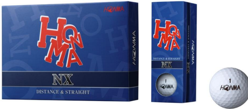
『HONMA NX』 (Color:White)