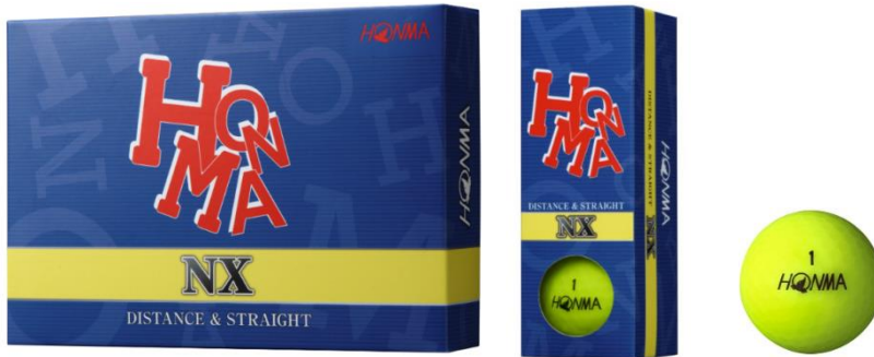
『HONMA NX』 (Color:Yellow)